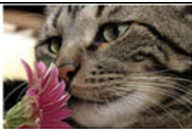
All of nature is my teacher

I know for sure that just as I wrote that, the most magnificent yellow butterfly flew by my window and that was no accident.